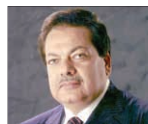
Mohamed Abou El Einein

On this occasion, I express my appreciation to the historic relations between the two countries and the two friendly peoples in Egypt and Japan. I would also appreciate the diplomatic relations that extend for more than 150 years. The relations between the two countries are based on co-operation and identical views on international issues.